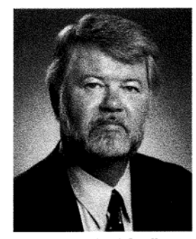
Certified in South Carolina State and Federal Courts

Areas of Emphasis: Personal Injury, Wrongful Death, Product Liability, Medical Negligence, Premises Liability, Contracts, and Insurance Coverage.