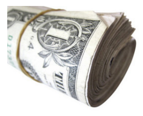
Update (May 4, 2015) : The Minnesota Supreme